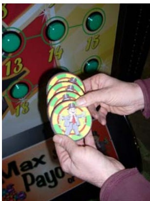
3. Player is Awarded Chips